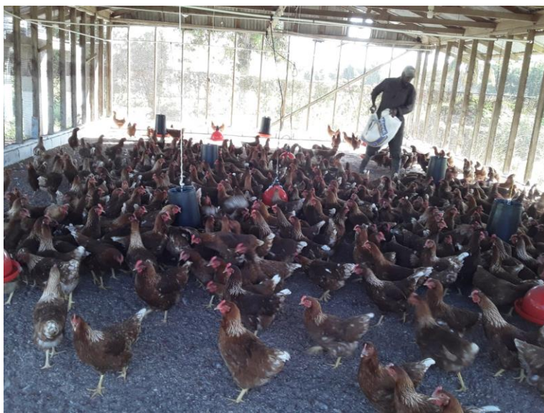
Layers being fed in the coop

Legendary reggae/ dancehall artist Buju Banton’s gift of a poultry/egg layers business, to Sunbeam Children’s Home, has been fulfilled. In July 2020, upon being announced winner of the Jamaica Song Festival, Buju Banton asserted, “I want to congratulate the true winners tonight. Everyone who participated in this competition: you’re all winners. I was happy to share the stage with you all. But for me the true winners tonight is the Sunbeam Boys Home. We did it Sunbeam Boys Home, We did it.”