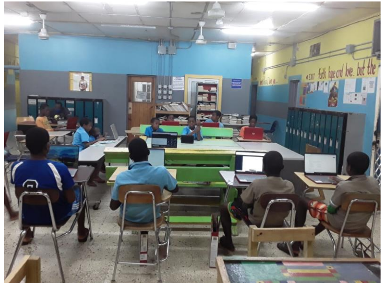
Residents at Sunbeam Children's Home, St. Catherine, engaged in e-learning, with their new laptops

By working closely with administrators at Sunbeam Children's Home, Mount Olivet Boy's Home and Denham Town High School. He launched the Murdine Clarke Scholarship; gifted assorted footwear, food and funds; including, his three million dollar cash prize win at the Song Festival Competition, to Sunbeam Children's Home; for construction of a chicken layers business.