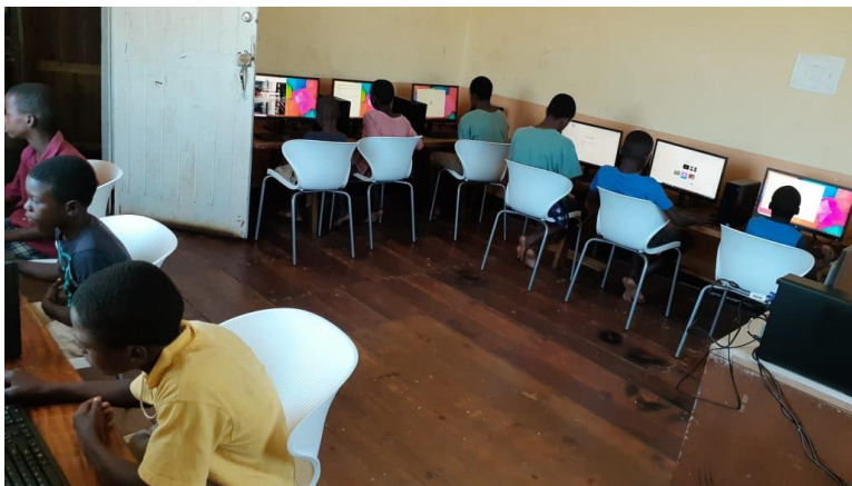
Wards of state at Mount Olivet Boys Home, Manchester, participating in online classes in new computer room