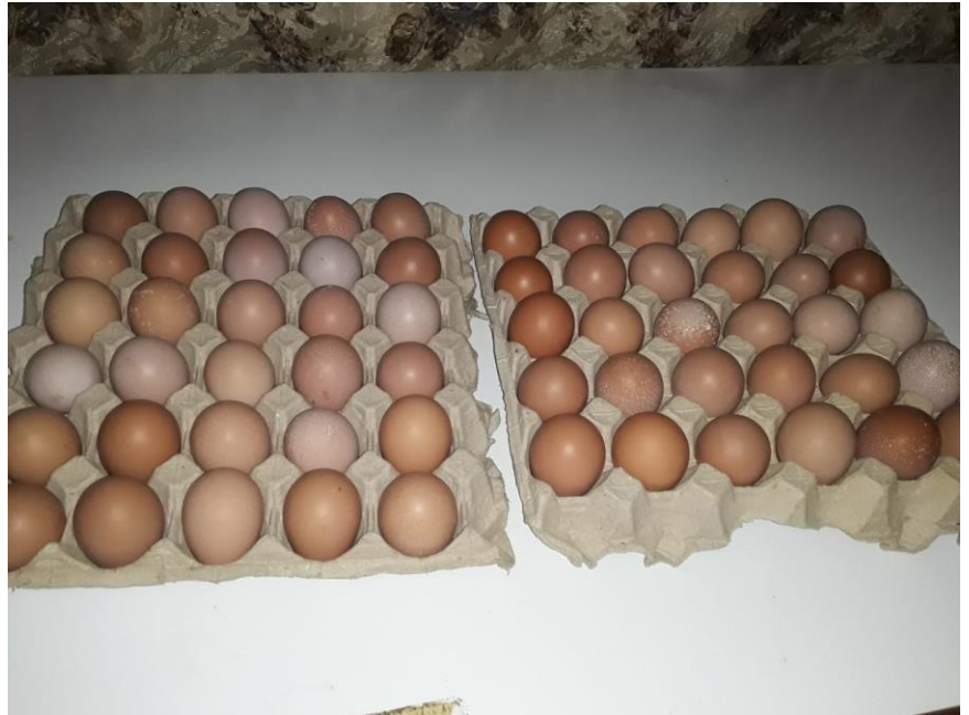
Eggs produced at Buju Banton sponsored Sunbeam Egg Layers Project

When I arrived, at work, the following day, the boys were beyond excited. Firstly, that their favorite artist, Buju Banton, won the Jamaica Song Festival and secondly, he acknowledged the facility, by name, on television. Expectations were high.