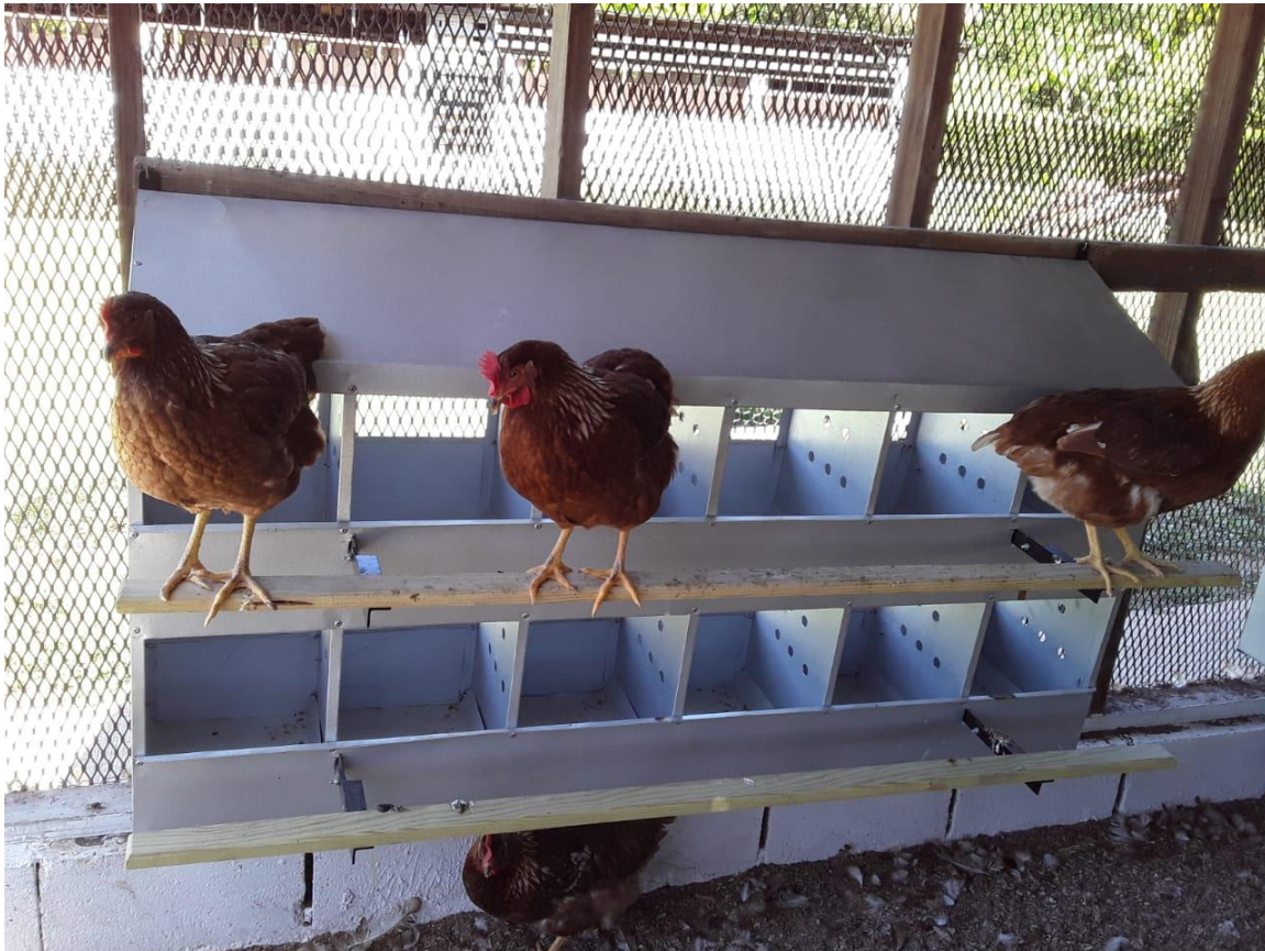
Layers on their perch